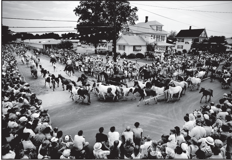
Photograph of ponies walking through town (NGS Image No. 719970), copyright © by Medford Taylor/National Geographic Stock. Used by permission.